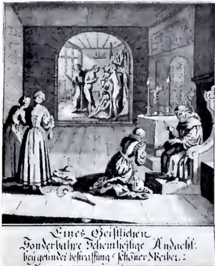
SPIRITUAL DISCIPLINE German; seventeenth century